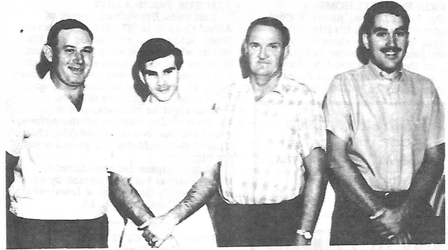
Alpine needs a pool service.

A Texan had three swimming pools - one filled with hot water, one filled with cold water and the third without any water at all. It was for people who could not swim.